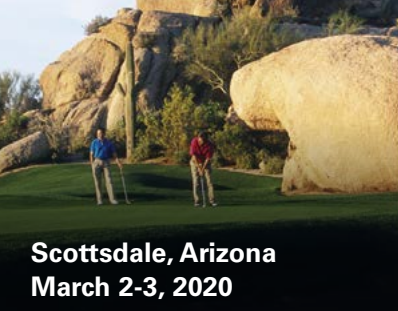
Scottsdale, Arizona March 2-3, 2020