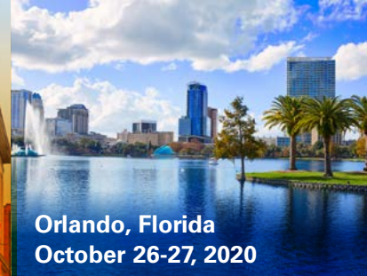
Orlando, Florida October 26-27, 2020