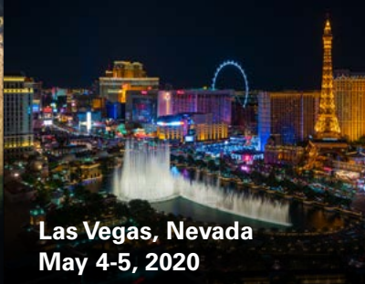
Las Vegas, Nevada May 4-5, 2020