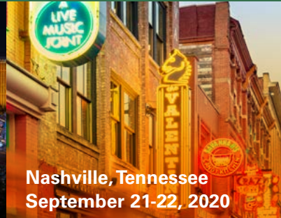
Nashville, Tennessee September 21-22, 2020