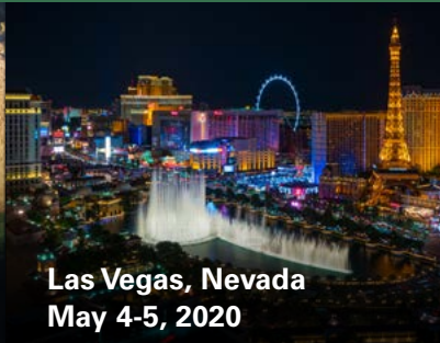
Las Vegas, Nevada May 4-5, 2020