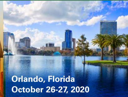
Orlando, Florida October 26-27, 2020