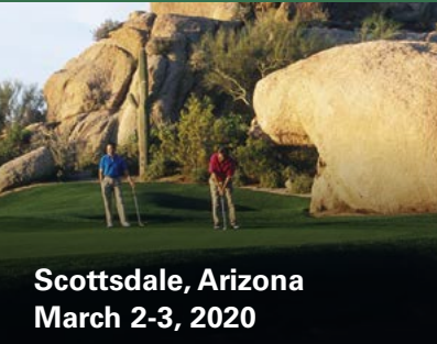
Scottsdale, Arizona March 2-3, 2020