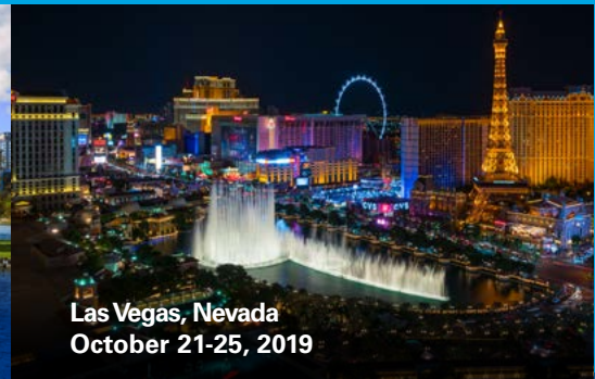
Las Vegas, Nevada October 21-25, 2019

"All compensation and benefits professionals should consider this seminar. There is a large volume of valuable information presented in an effective, dynamic setting. The speakers are certainly well-equipped and are very attuned to the needs of the class members."