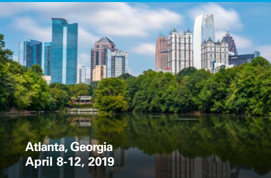
Atlanta, Georgia April 8-12, 2019