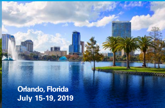
Orlando, Florida July 15-19, 2019