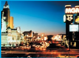
Las Vegas October 16-20