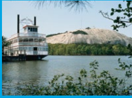
Atlanta May 1-5

INSTITUTE FOR APPLIED MANAGEMENT & LAW, INC. The Professional's Choice in Training Since 1979