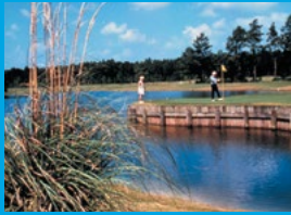
Orlando July 17-21