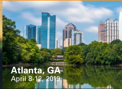
Atlanta, GA April 8-12, 2019