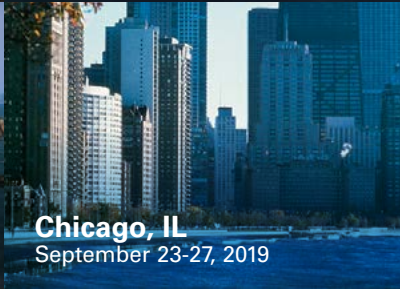
Chicago, IL September 23-27, 2019