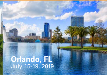
Orlando, FL July 15-19, 2019