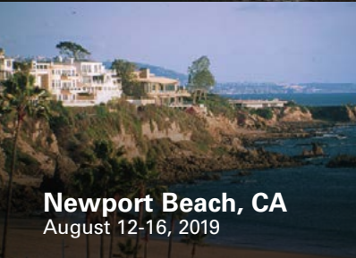
Newport Beach, CA August 12-16, 2019