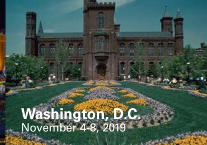
Washington, D.C. November 4-8, 2019

“I was very impressed that our instructors were relevant and currently practicing law. Their knowledge and ability to teach/lecture was incredible. I would recommend this training to all of my colleagues.”