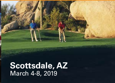
Scottsdale, AZ March 4-8, 2019