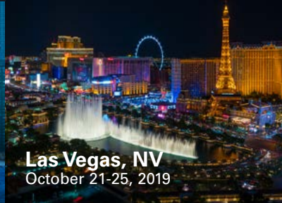
Las Vegas, NV October 21-25, 2019