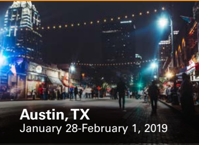
Austin, TX January 28-February 1, 2019